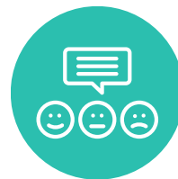
Feedback from trainees, instructors and managers