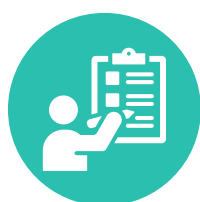
Trainer performance assessments