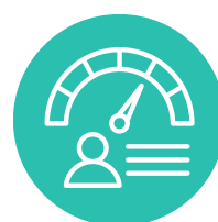
Observation of job performance

Evaluation is a dynamic process with three major activities: monitoring of indicators, analysing information, and initiating corrective actions.